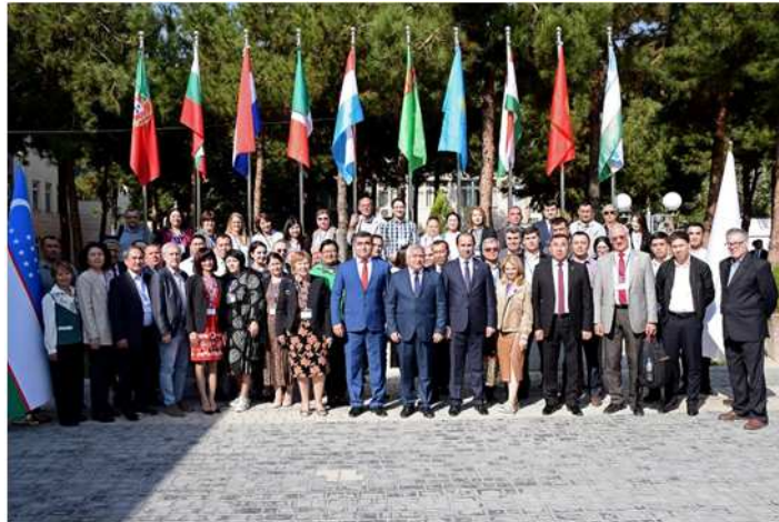
Visiting of the Andijan Machine-Building Institute HiEdTec office