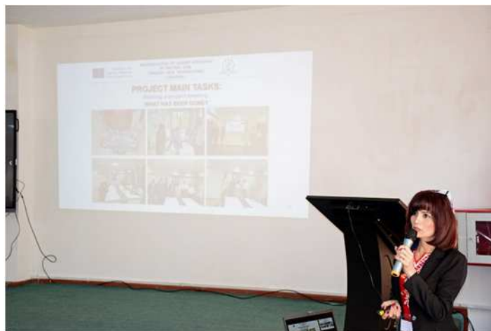
Presenting the results of P10 Technological University of Tajikistan