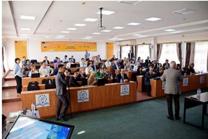
Presenting the results of P8 Khorog State University named after M. Nazarshoev