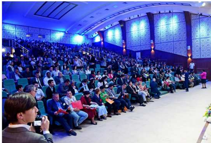
Photo of the Project Meeting participants in Andijan Youth Centre