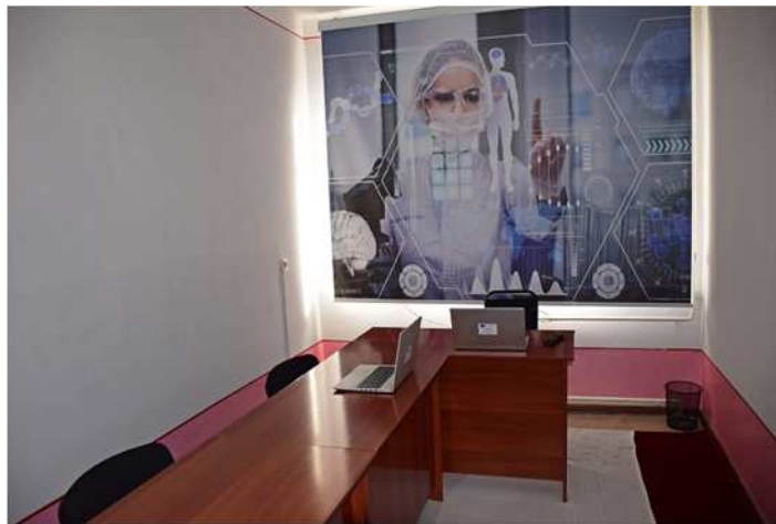
Active Learning Classrooms