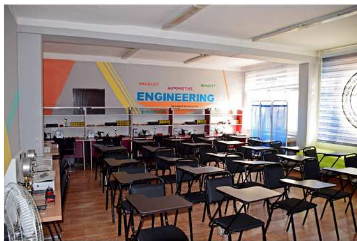
Visiting Andijan State University