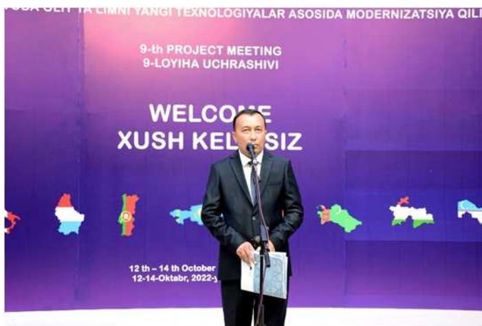
Welcome speech by the representative of the public administration of Andijan region